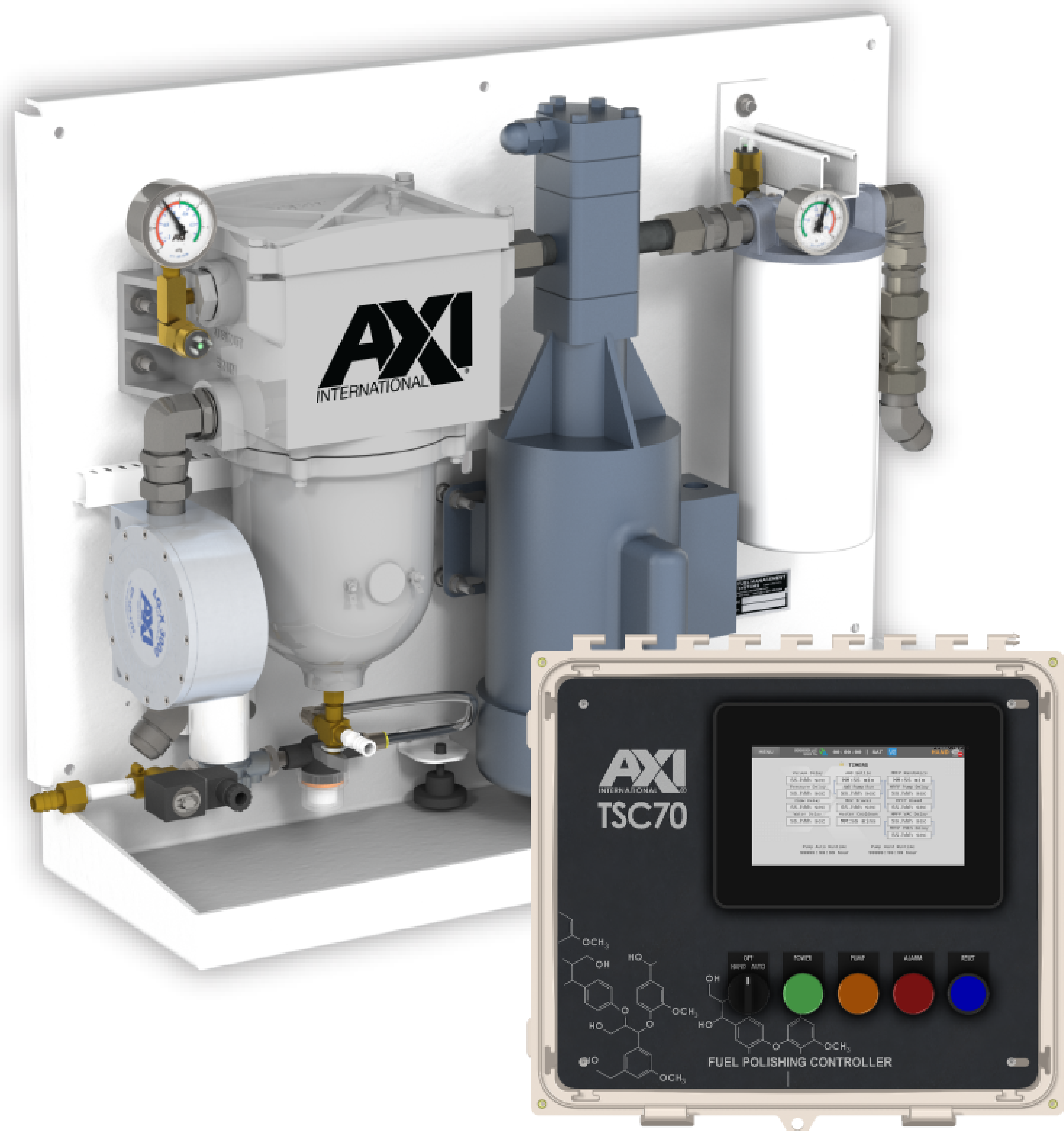
FPS LX-F with upgraded TSC70 Touchscreen Controller

The FPS LX-F is a programmable, fully automated, fuel maintenance system that removes water, sludge, and other contaminants from fuel storage tanks. Once installed, the FPS LX-F system operates independently to ensure fuel reliability through routine fuel filtration. The system's fuel polishing process stabilizes diesel and bio-fuels, eliminating microbial contamination and ensuring the fuel remains clean. These compact fuel maintenance systems are specifically designed for permanent installations indoors, as well as confined spaces, such as inside gen-set enclosures or engine rooms.